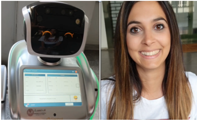
Figure 1. The iSanbot application for emotion detection.

to modify the robot behavior. [2] employs a number of questionnaires, and then clusters the data to produce a number of stereotypes in form of personas. [4], which presents a companion robot that is adapted to the user by performing an initial questionnaire for configuration, More recently, [11, 12] exploits unsupervised methods to obtain the user's profiles.